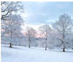
The first day of winter was December 21, 2011.

notices including you package notices please make sure the Management Office has your current email address. If you are currently receiving paper notification and would like to continue that way we will continue to deliver notices to your apartment. Please note that any request for package delivery during the week should be on an emergency basis.