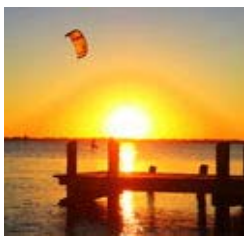
The first day of summer is June 20, 2012.