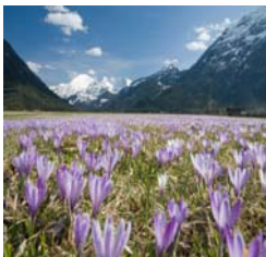
The first day of spring is March 20, 2012.